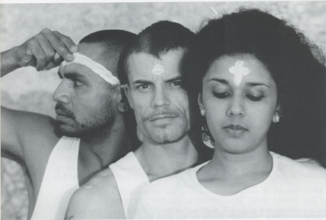
left: Dancers from The Land, the Cross and the Lotus