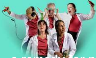
Antidote - a remedy for now