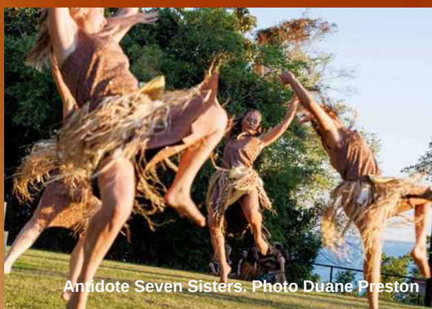
Antidote Seven Sisters.

The vitality of living culture enriched by traditional and contemporary life